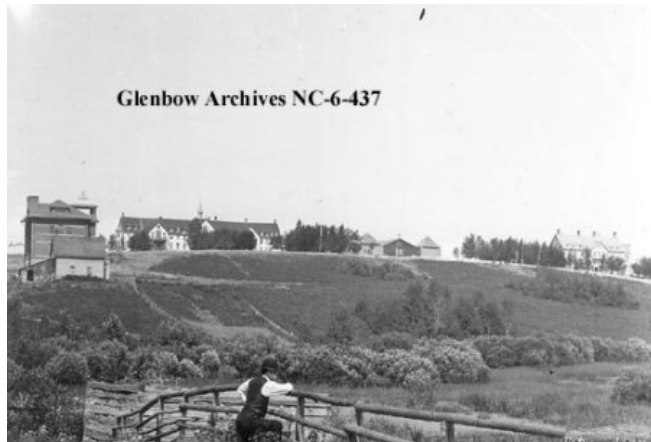
The valley of the Sturgeon River at St. Albert, 1912.