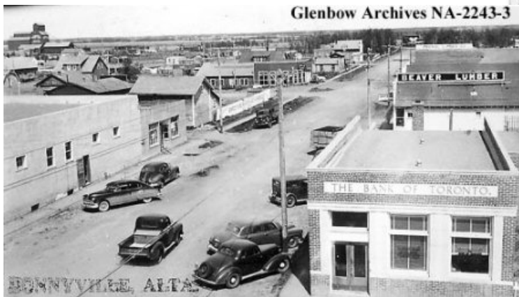
Bonnyville ~ 1948