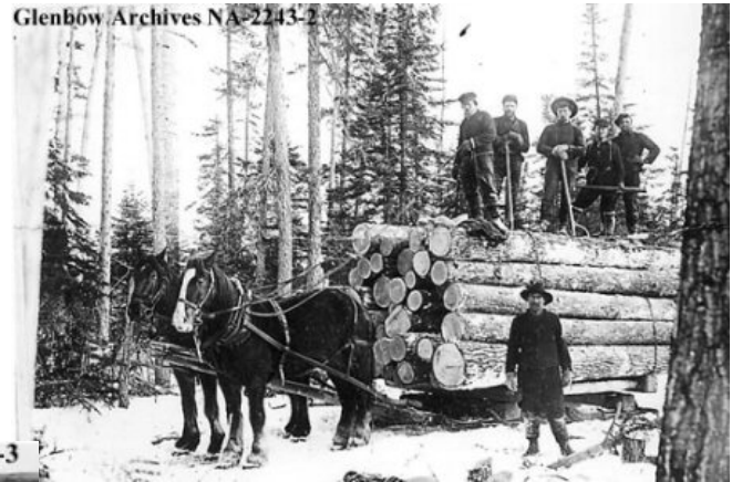
Hauling logs near Bonnyville, n. d.