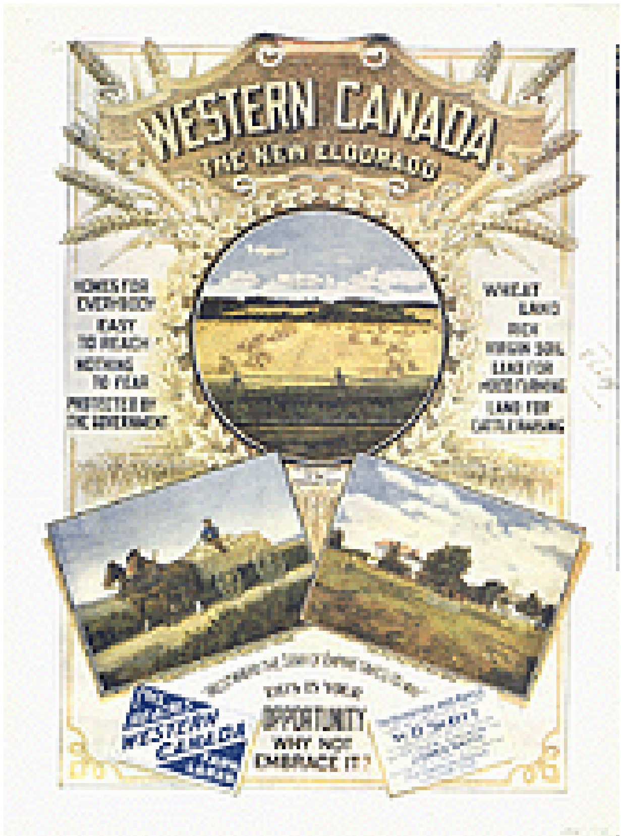
USE/REPRODUCTION Copyright expired Department of Immigration, Canada (Publisher) http://data2.collectionscanada.ca/ap/c/c085854k.jpg